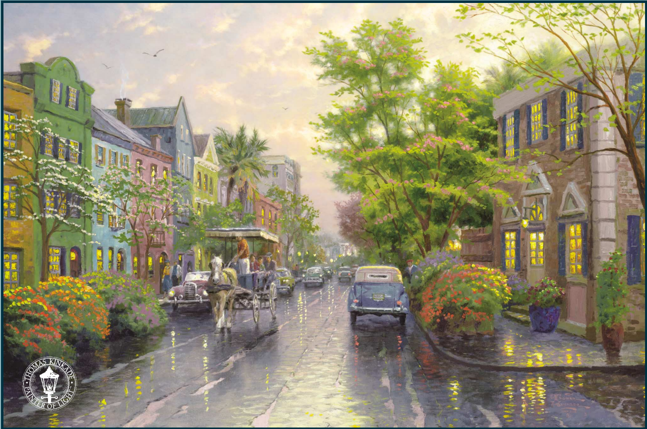
Charleston, Sunset on Rainbow Row • Image Sizes: 18" x 27", 24" x 36", 28" x 42" • Publish Date: August 2004