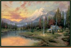
EVENING MAJESTY Beginning of a Perfect Evening I