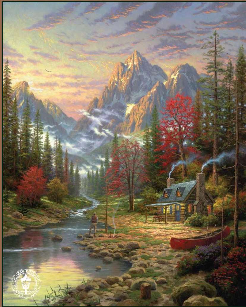
Title: The Good Life • Image Sizes: 20" x 24", 24" x 30", 32" x 40" • Publish Date: April 2004