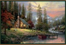
A PEACEFUL RETREAT Beginning of a Perfect Evening II